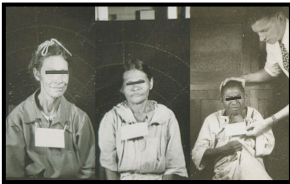
Some of the subjects in the Guatemalan experiments